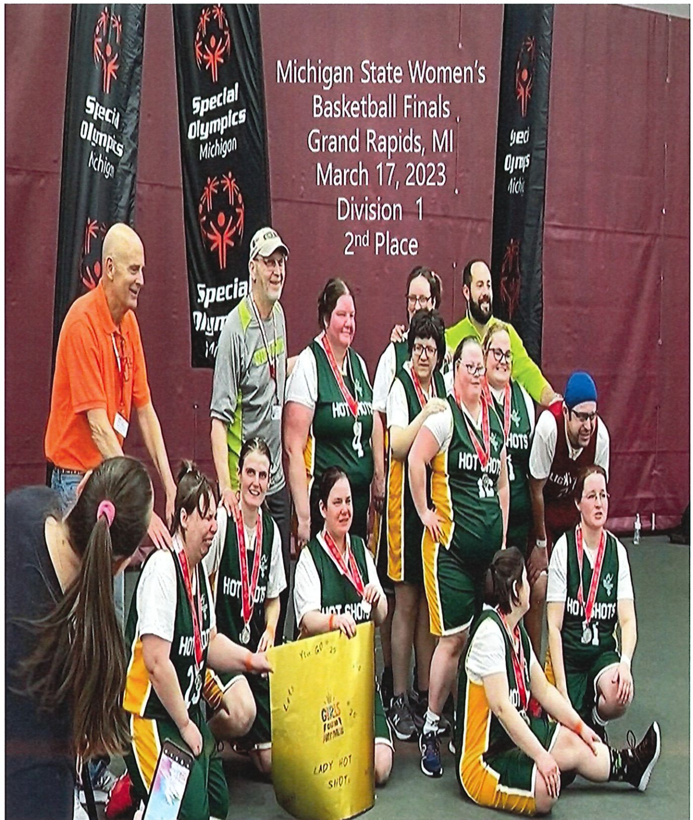
The Arc Athletic Ladies Hotshots Basketball team Capture 2nd place at The Michigan State Women's Basketball Finals in Grand Rapids MI on March 17, 2023 Division One . Congratulations Ladies!