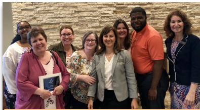
Some of the Arc NW Staff