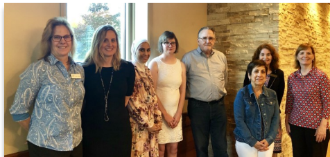
Some of the Arc NW Board Members